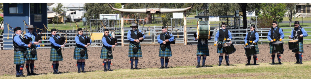
Pictured is our band playing at The Queensland Light Horse Competition in Pittsworth

On Sunday the 25th of September, our band played at the Queensland Light Horse competition at Pittsworth. Our Society's involvement and support for the local Light Horse has been consistent since its inception in the late 1800s. This is something we, as a Society, are extremely proud of, and has been officially acknowledged by the Queensland Light Horse Association.